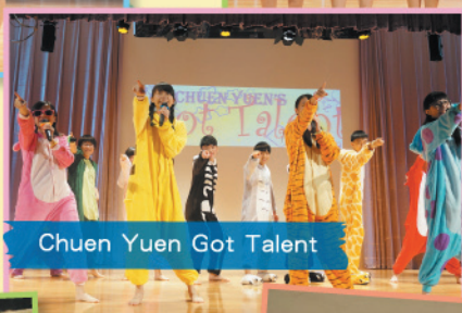
Chuen Yuen Got Talent