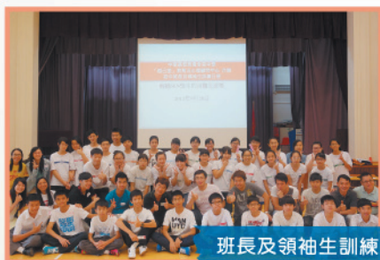
班長及領袖生訓練