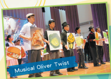
Musical Oliver Twist