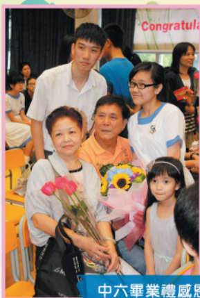
中六畢業禮感恩獻花