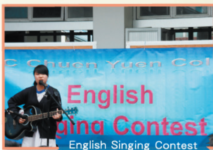
English Singing Contest